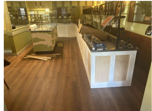
Salad bar in progress