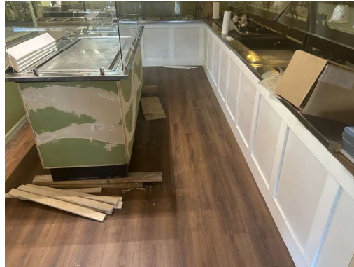
Dessert bar in progress