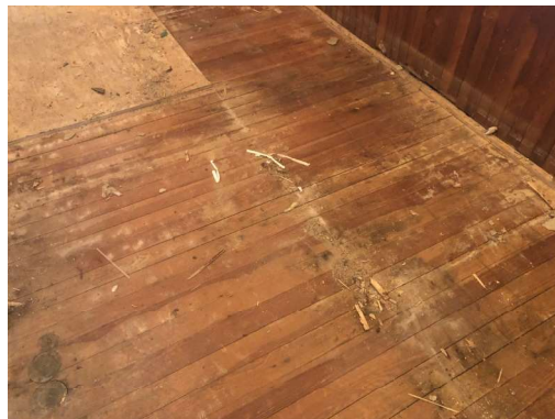
Original 1910 oak flooring