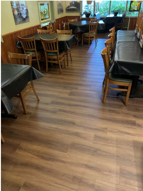
New dining area

This 113 year old home has just been closed for a week for major floor repairs and renovations which are still in progress. We are now open again and ready to serve our loyal customers. Thank you for dining with us.