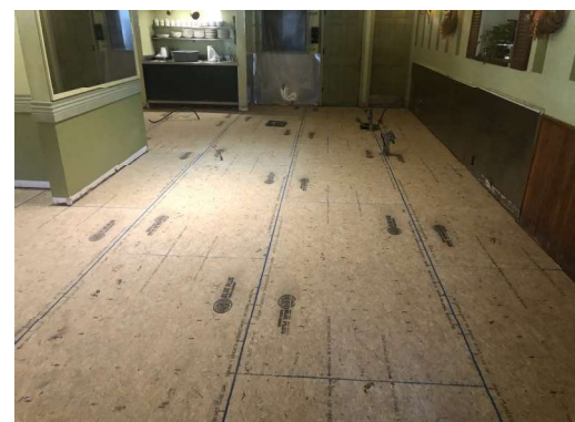
New base flooring